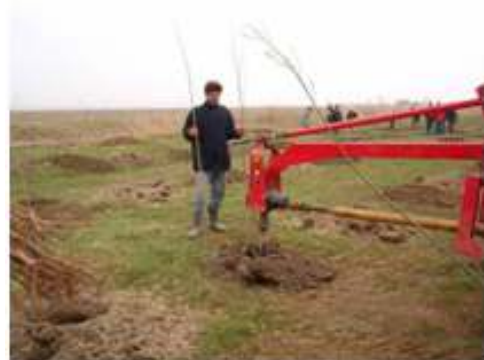
Fig. 3. Mechanically digging