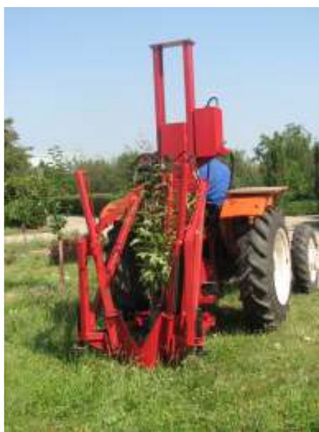
Fig. 6. Equipment for extracting seedlings