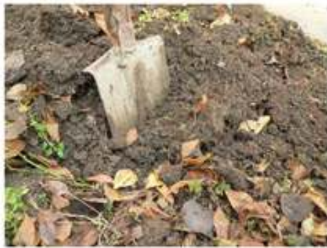
Fig. 2. Manually digging