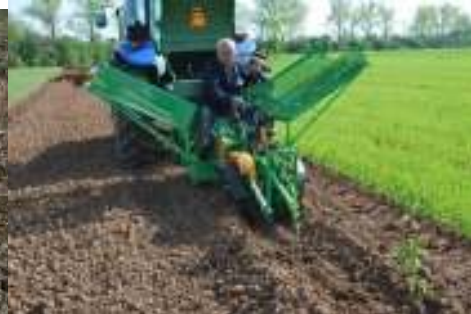
Fig. 5. Planting