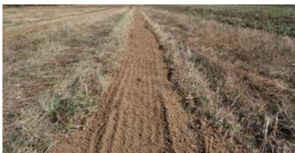
Fig. 4. Soil working in stripes