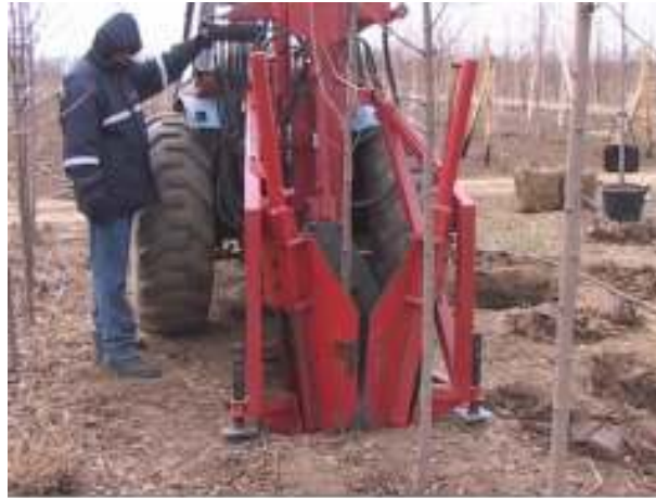
Fig. 9. Equipment explant 500